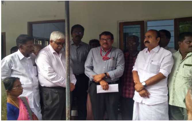
Official handing over of the House built with support from MITS Staff Welfare Fund, at Chennamangalam, Paravoor.