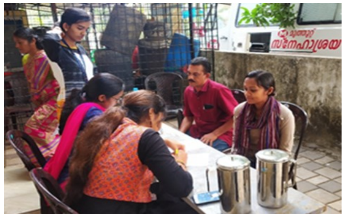
Medical camp at Nermal colony.