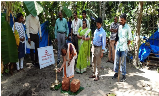
Housing Project at Kumarakam. New Venture by Civil Engg Dept.