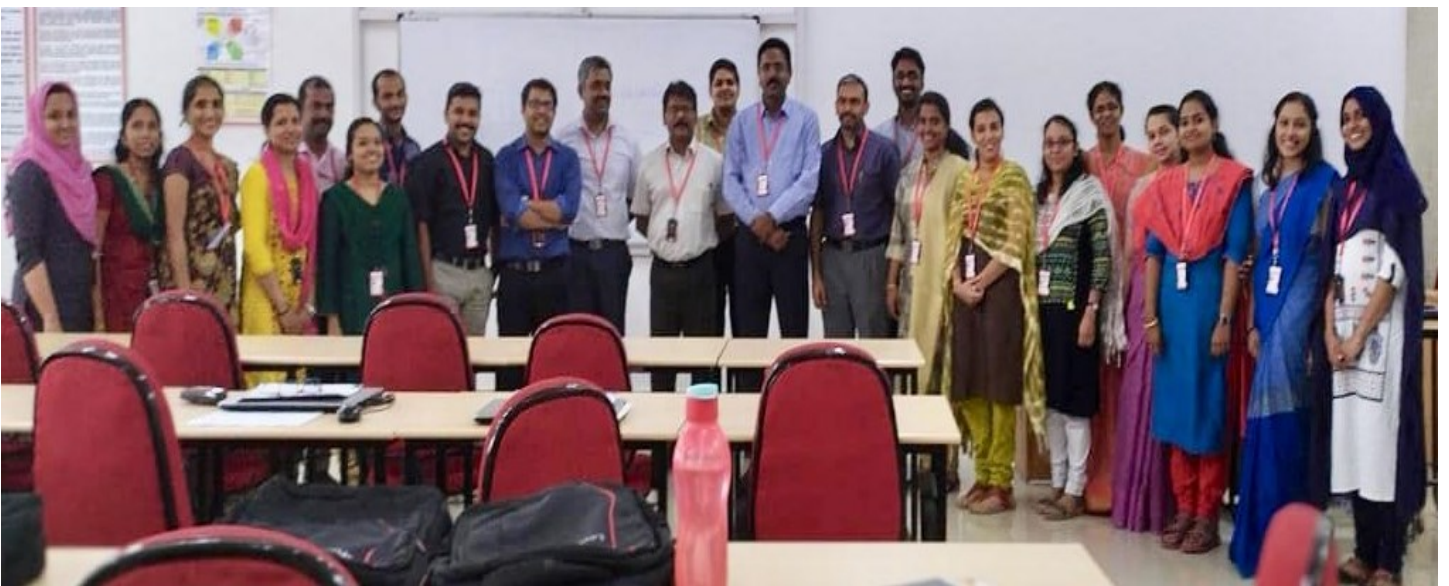
Six day Faculty Development Program organized by CSE Dept. Dec 4 th 2019.