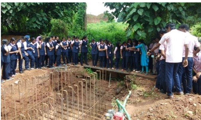
Site-visit to retaining Wall and Box culvert site under the project of LSGD Puthencruz panchayath, by S5 CE students along with faculties and Technical staff.