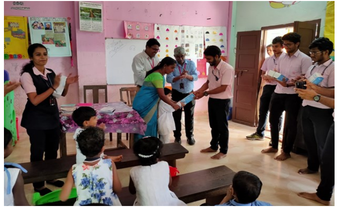
World Food Day- Visit to Mother Care.